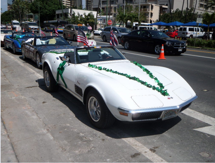
2015 St. Patrick's Day Parade—Waikiki